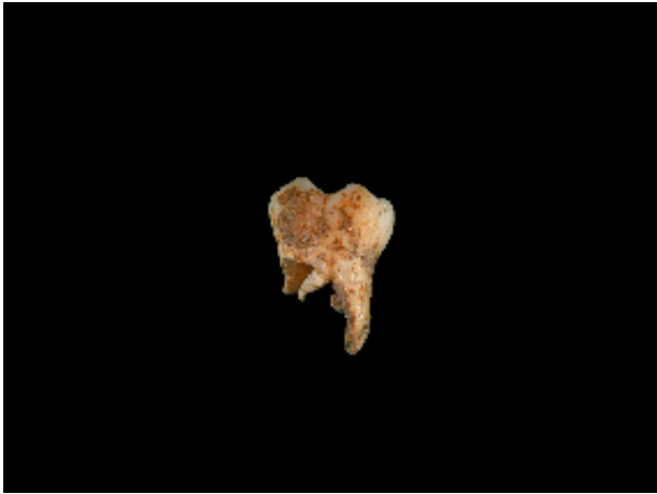
(c) Aude Bergeret, Musée des Beaux-Arts d'Angoulême 2005