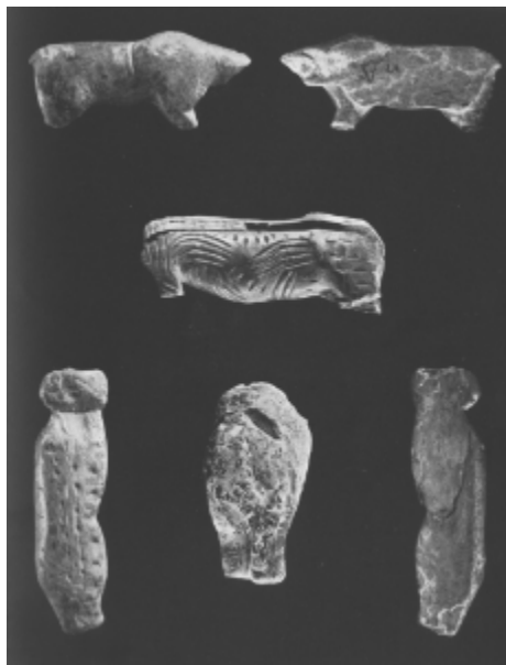
Vogelherd ivory figurines, Aurignacian