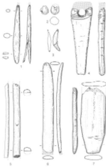
31 Knochen und Elfenbeinreste des Aurignacien im Lössstal (I.S. Vogelherd IV; 2-5, 7, Skelet IV; a.6. Vogelherd IV); Maßstab 2:1