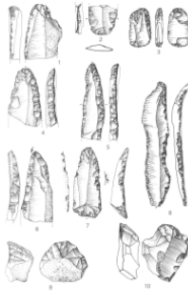
32 Steinwerkzeuge des Vogelherd-Aurignacien (I-Schicht IV; 1-5, 8, und II Schicht IV; 6-7, 9 Schicht V); Maßstab 2:1