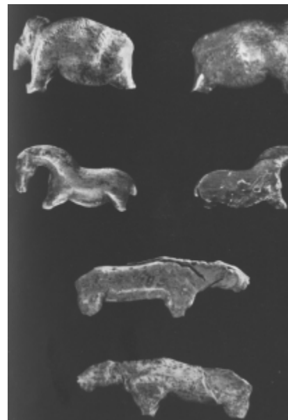
Vogelherd ivory figurines, Aurignacian