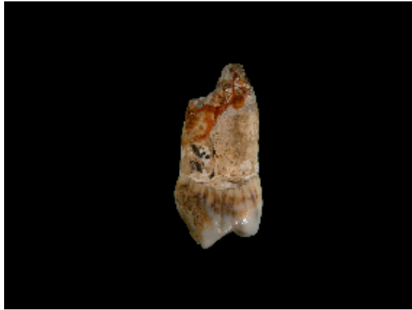
(c) Aude Bergeret, Musée des Beaux-Arts d'Angoulême 2005