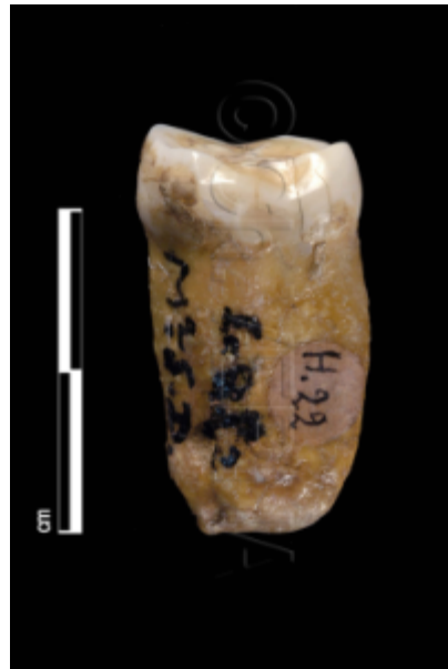
Distal view of La Quina 22 (© Christine VERNA/ Muséum, Lyon).